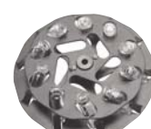
10 x 1.5 mL HPLC Vials