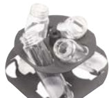
4 x 40 mL Scintillation Vials

The versatile Centrifan™ PE has a rotor to fit your needs. Choose from one of seven different standard rotors, or we can make a custom rotor for your application.