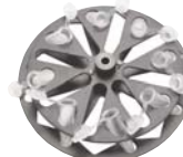
8 x 1.6 mL Micro Centrifuge Vials