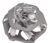
6 x 16 mm x 100 mm Test Tubes