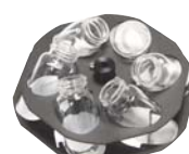
6 x 20 mL Scintillation Vials