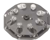
8 x 4 mL Vials