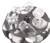
6 x 30 mL Scintillation Vials