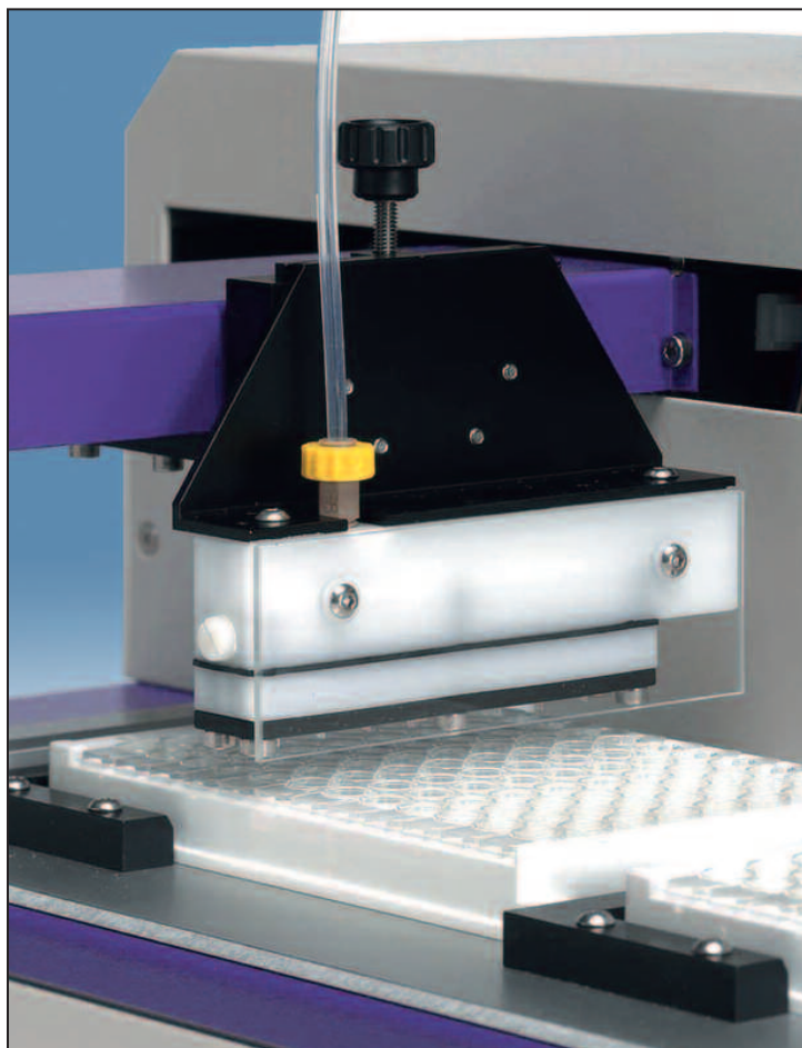
Height Adjustable Manifold